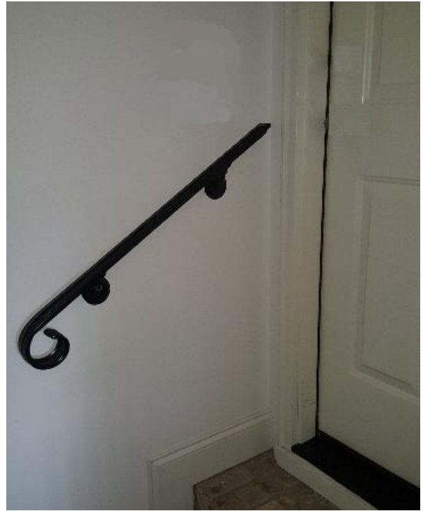
Wall mounted in garage