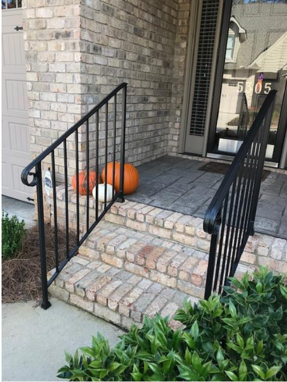
Both sides down to sidewalk level