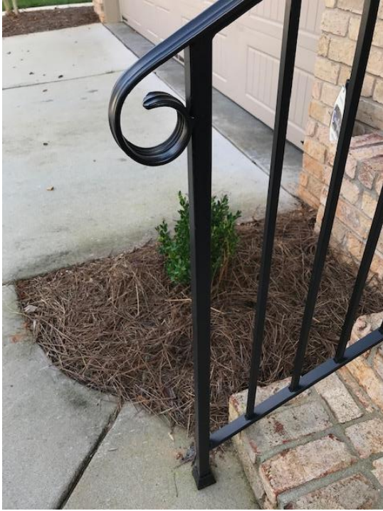
Open volute lower handrail end