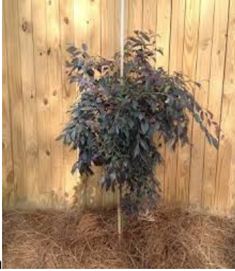
5. Loropetalum , tree-form