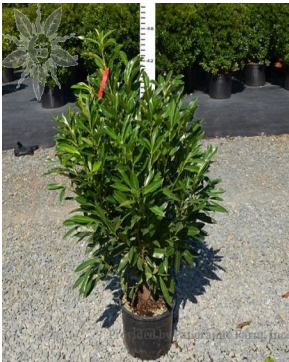
1. West Coast Laurel