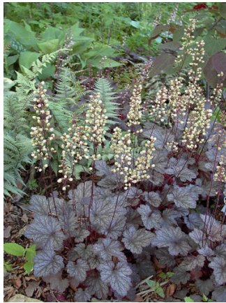
5. Coral Bells (Heuchera) (shade)