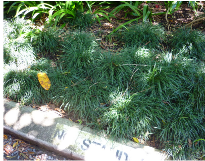
4. Mondo Grass (shade)