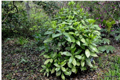
1. Goldust Aucuba