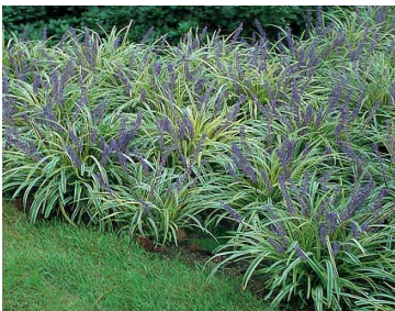
1. Liriope & Variegated Liriope