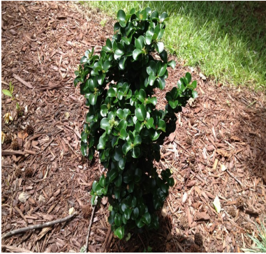
3. Curlyleaf Ligustrum