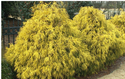
1. Gold Mop Cypress