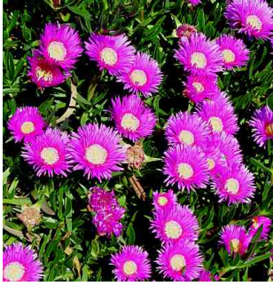
3. Ice Plant (Sun)