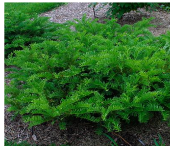
Prostrate False Yew (Cephalotaxus)