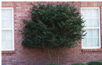
2. Fineline Holly or Dwarf Burford Holly