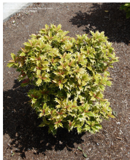
4. Goshiki Osmanthus