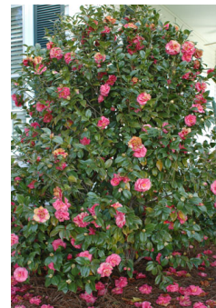
Camellia Japonica or Sasanqua