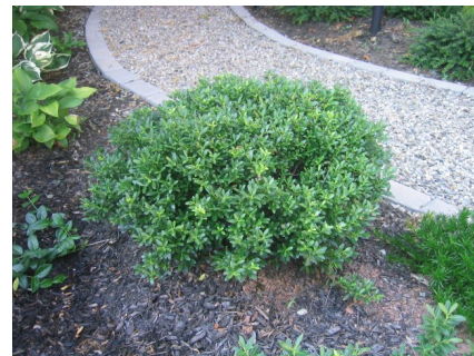
Soft-touch Holly , allow to spread